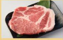
Aged Pork 150g 1200