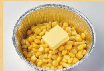
Corn with Butter 500