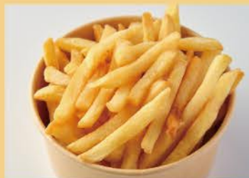
French Fries 400