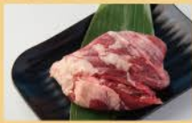
Outside Skirt 160g 1800