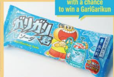
Soda Flavored Popsicle 200