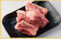
Rib Finger Meat 160g 1600