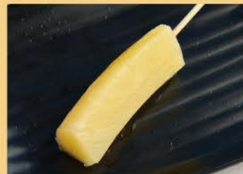
Stick Pine 1pcs 100