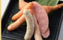
Assortment of Sausages 1300 Bone-in / Corse-Ground / Cheese / Basil