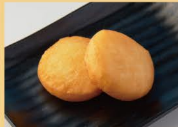
Fried Mashed Potato Balls Filled with Cheese 2pcs 500