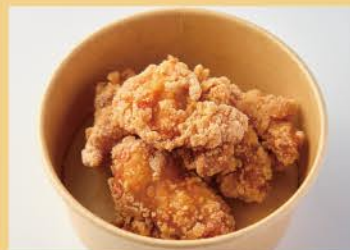
Deep-Fried Chicken 4pcs 400