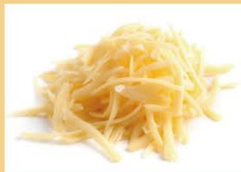
Cheese Topping 300