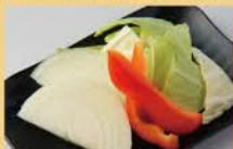
Assortment of Vegetables 400 Onions/Paprika/Cabbage