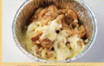
Chicken Harami (abdominal area) and Cheese 100g 1000