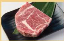
Japanese Black Beef 150g 2200

Outside skirt and rib finger meat are not Japanese Black Beef